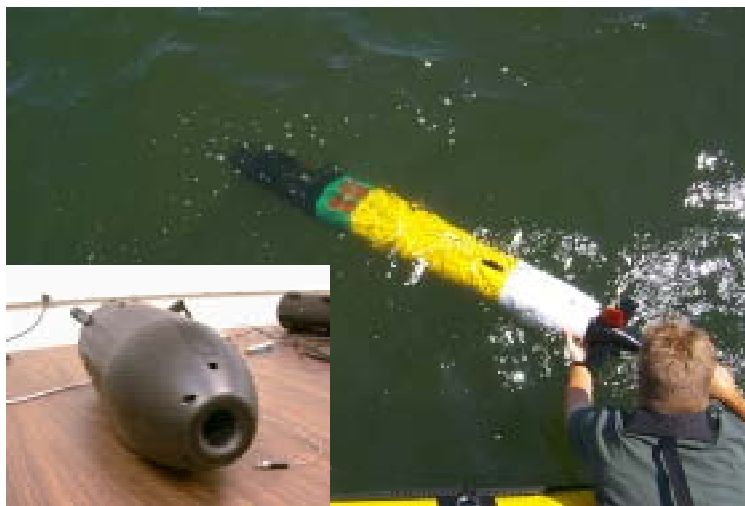
Figure 1. Bioluminescence REMUS AUV and nosecone (inset)

measurements in the NSF's LTER program to identify the significant bioluminescent organisms and define the environmental forcing of these communities during the episodic Winter and Spring rain events.